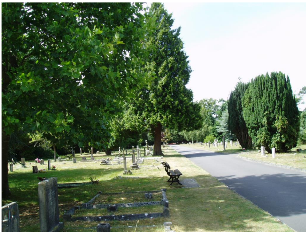
Christchurch Cemetery

Christchurch Cemetery, Christchurch, Dorset has 53 Commonwealth War Graves – 24 from World War 1 & 29 from World War 2.