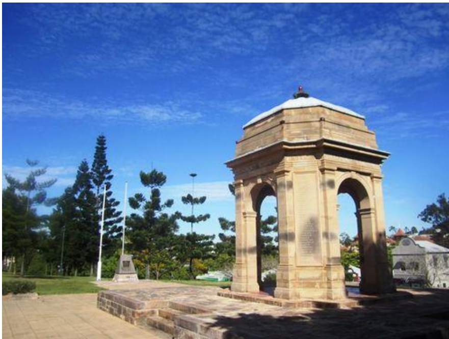
Windsor War Memorial