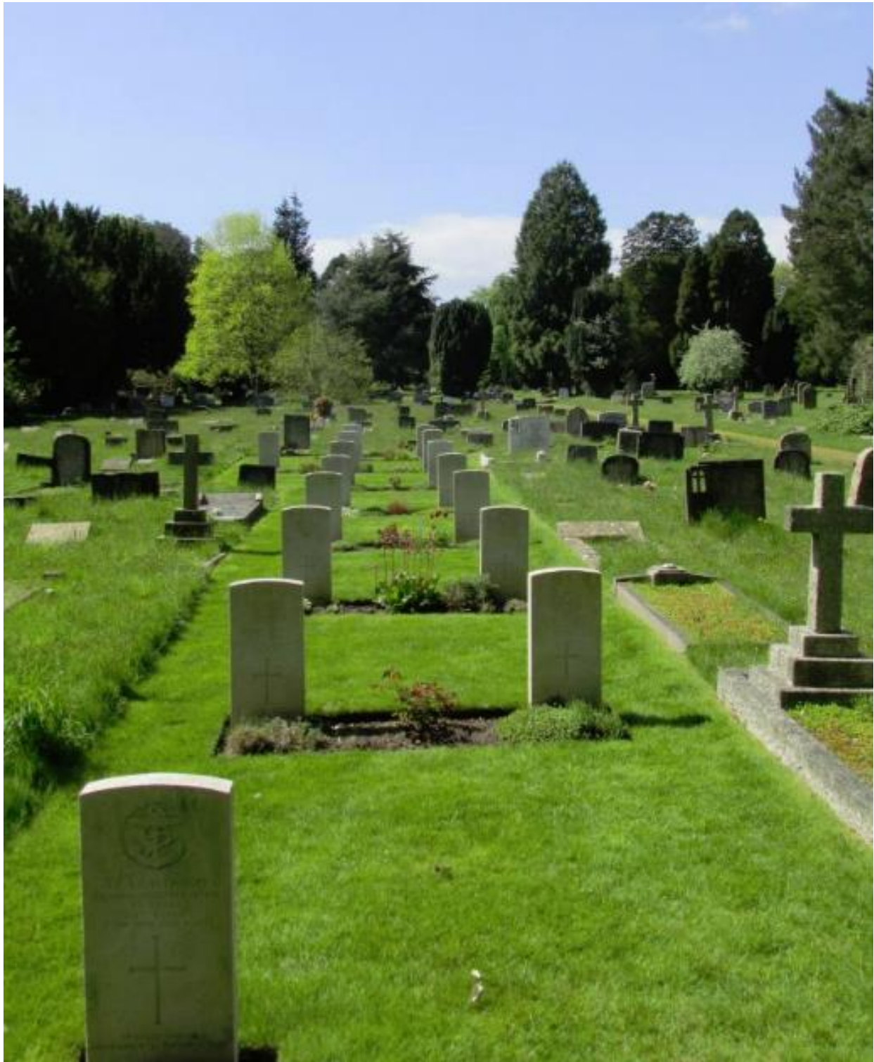
Some War Graves in Christchurch Cemetery