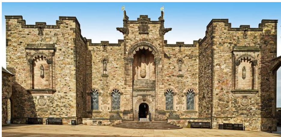
The Scottish National War Memorial & the Hall of Honour & the Roll of Honour books.