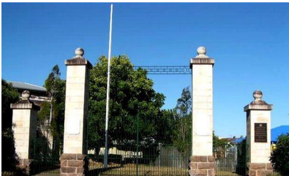
Langlands Park Memorial Gates