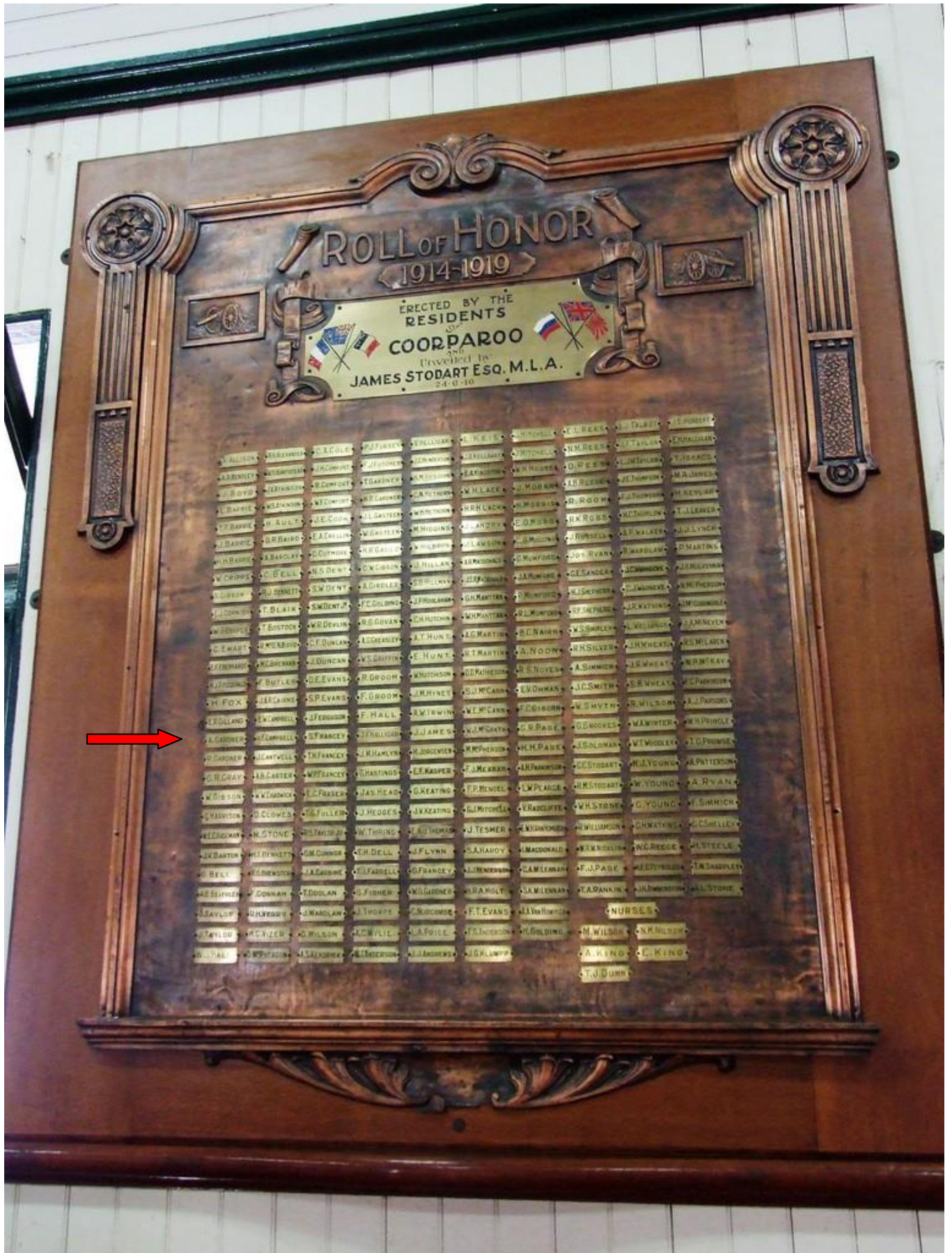
Coorparoo Roll of Honour